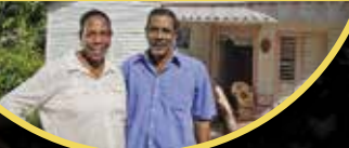
Pictured above: Members of the ACOPAGRO cacao co-op and their families welcome visitors to their community, Shepte, in Peru.

Equal Exchange trades only with farmer co-operatives. These men and women do more than work on the land. They vote and serve as leaders—and together, they decide how to use fair trade premiums in their own communities.