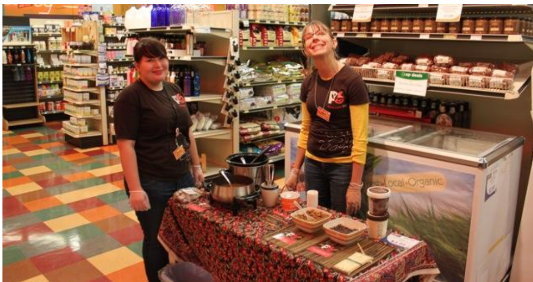
Community Mercantile staffers in their P6 shirts.