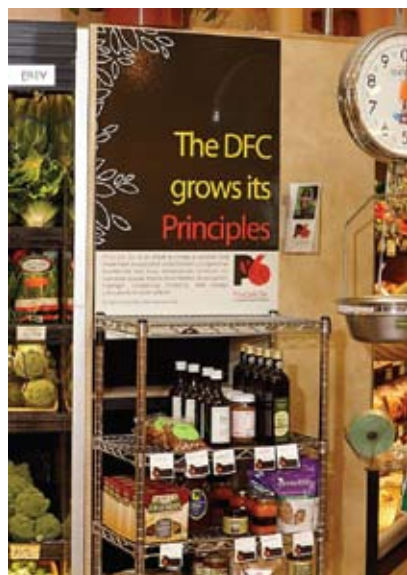
A Davis Food Co-op P6 sign.