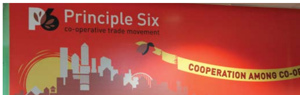
Seward Co-op has added P6 graphics above the community bulletin board (top) and deli counter (bottom).