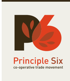
Davis Food Co-op's P6 brochure.