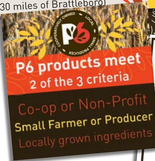
P6 shelftalkers from Brattleboro Food Co-op (top), Davis Food Co-op (right), and The Merc (above).